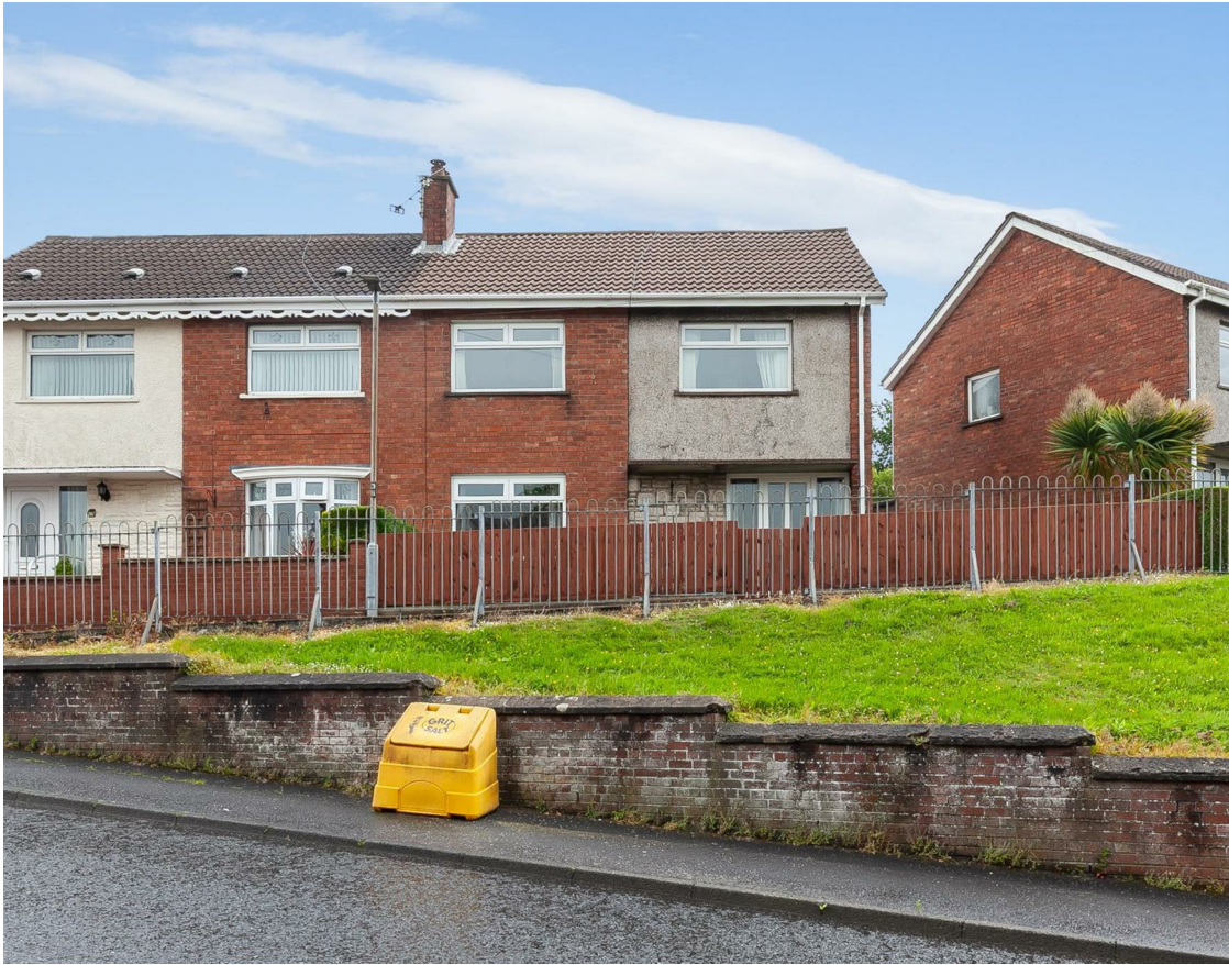
110 Queens Avenue, Newtownabbey, BT36 5HX